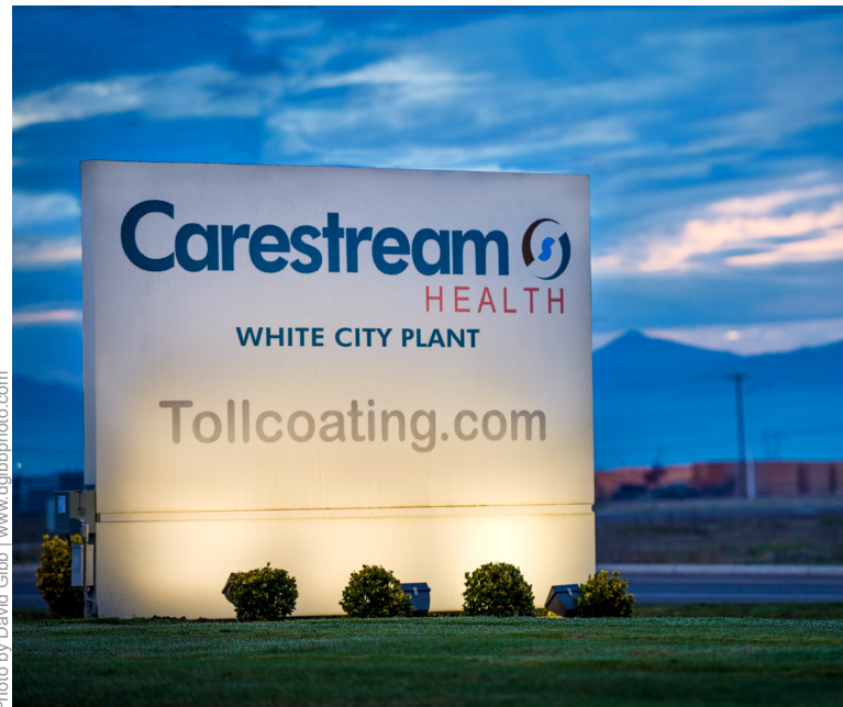
Nearly 300 people work at Carestream everyday in Southern Oregon where they create new technology, engage in lean manufacturing, and serve a global customer base that spans more than 170 countries.