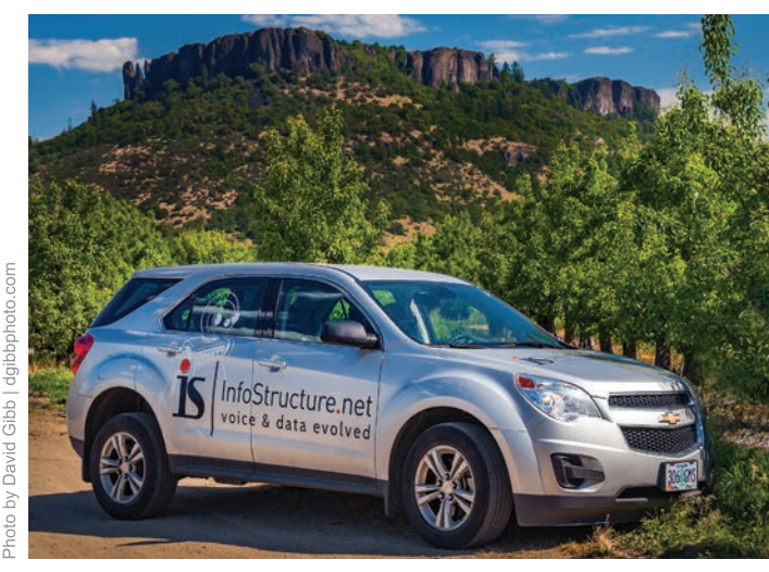
Customer-driven and community-focused.

"We've grown exponentially over the last 15 years because we're right here in the Rogue Valley. We're connected to the businesses and