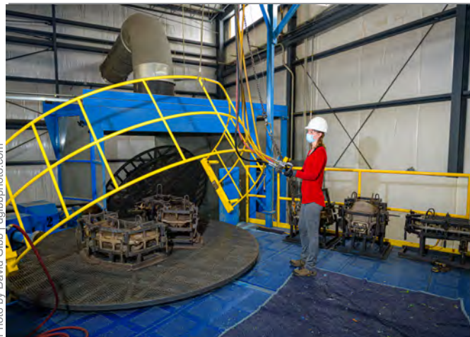
A Playcraft employee works on a piece of a future playground.

In 2017, the company was acquired by PlayCore and officially changed its name to Playcraft Systems. They chose to remain in the Rogue Valley, and today, Southern Oregonians will find Playcraft playgrounds in nearly every city park. Moreover, Playcraft Systems is not just a local supplier—or even a national supplier. Currently, the company has playgrounds in Japan, China, Singapore, Saudi Arabia, Israel, and several other countries in Asia.